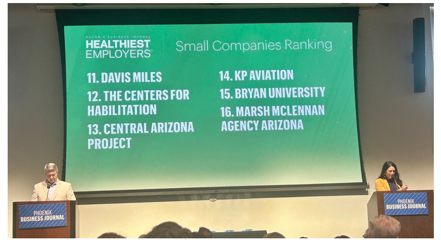
Thank you, Phoenix Business Journal, for ranking us as one of the Top 15 Healthiest Employers in the Small Companies category!

Yesterday, JOI provided a pizza luncheon for our Yuma staff as a thank you for their dedication and effort. We're proud of our team and grateful for the recognition!