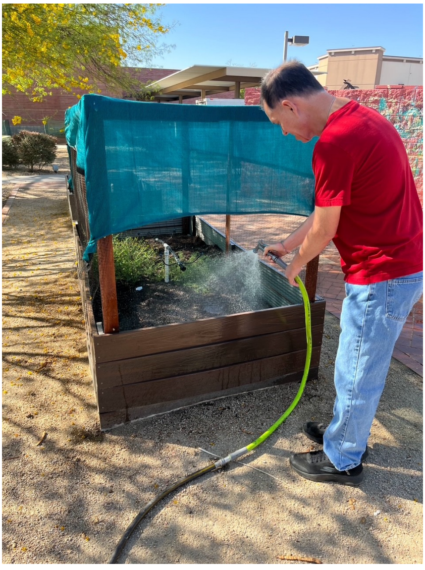
Spring has sprung, and our garden club is getting busy!