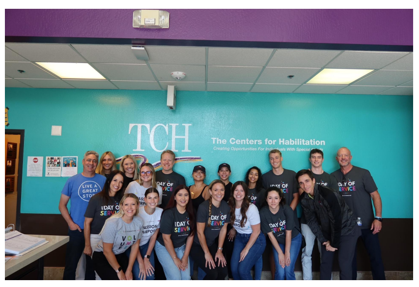
Volunteer Appreciation Week was this month, and we are very grateful for those who have dedicated their time to supporting our mission. Whether you have volunteered with us once or many times, your support is much appreciated!