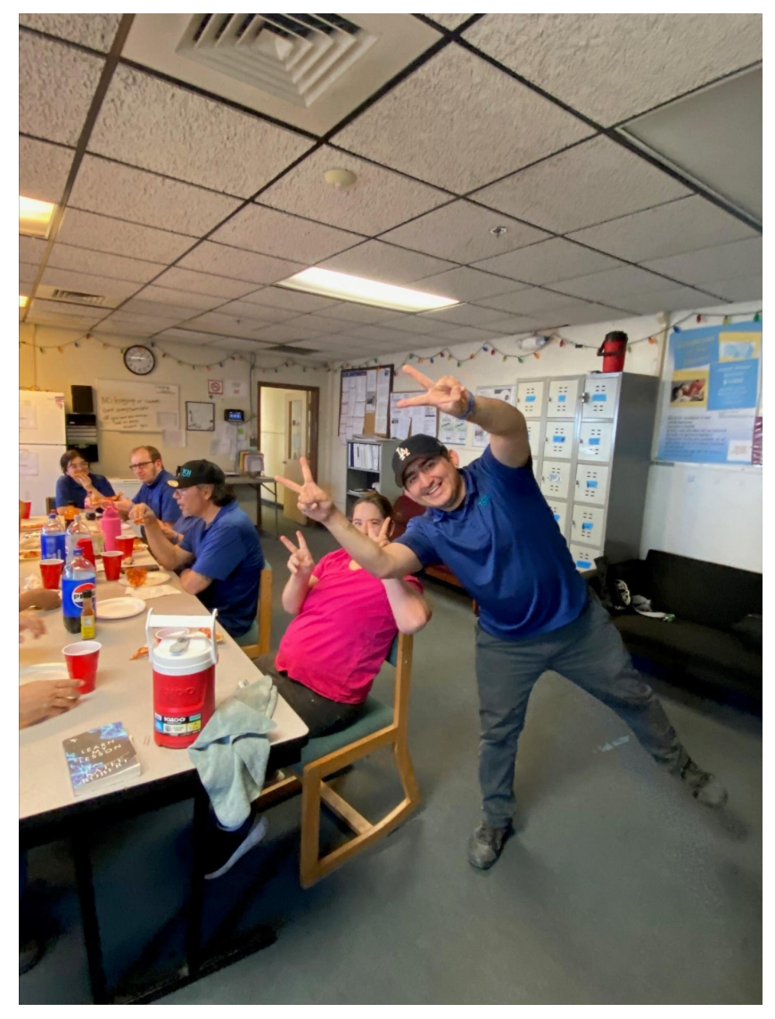
Last month, our team in Yuma had their <u>Source America</u> audit and absolutely crushed it! Their hard work was recognized by <u>Job Options, Inc.</u>, and they wanted to show their appreciation.

Yesterday, JOI provided a pizza luncheon for our Yuma staff as a thank you for their dedication and effort. We're proud of our team and grateful for the recognition!