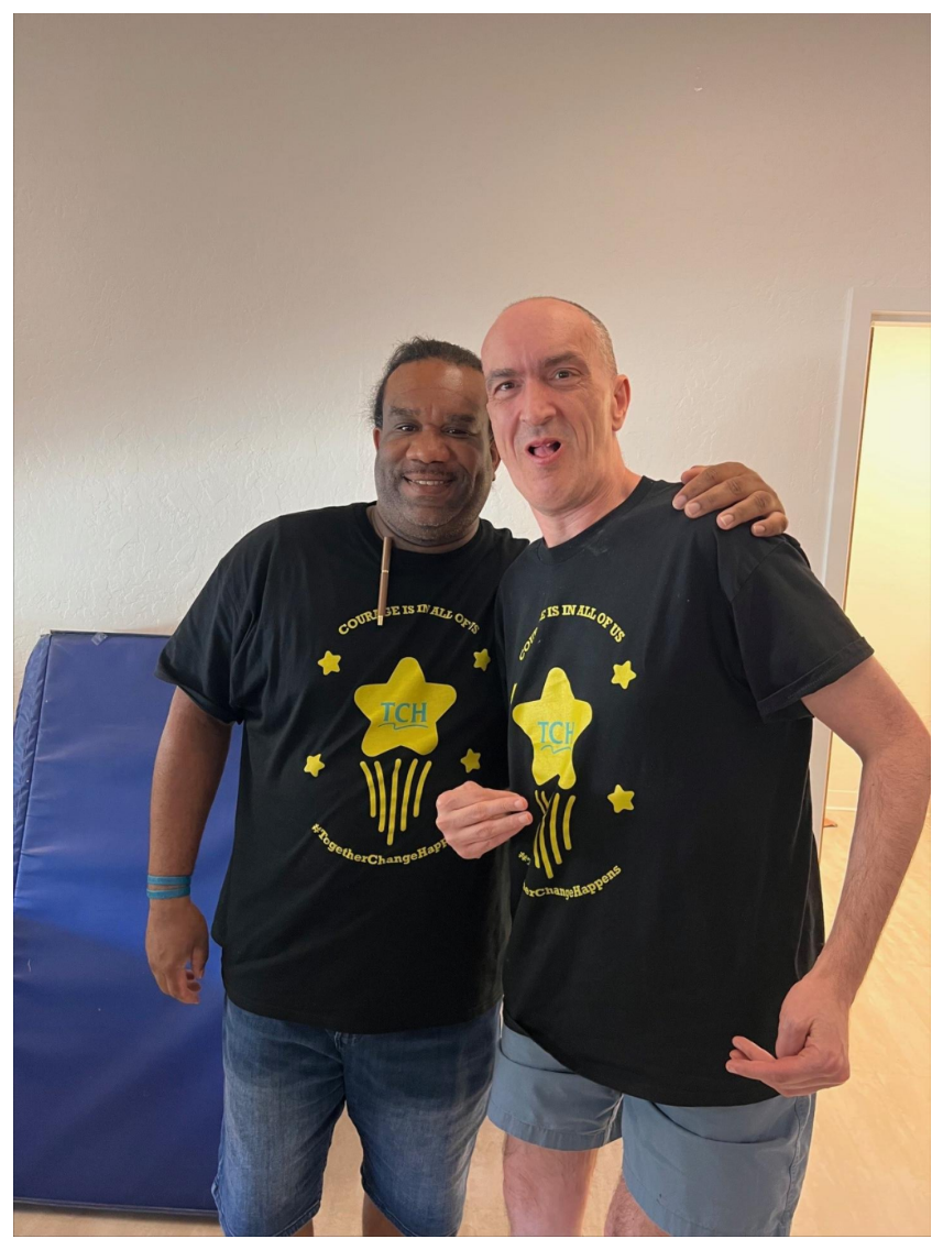
Seeing double? One of our many spirit days this month was Twin Day, and it was hit.