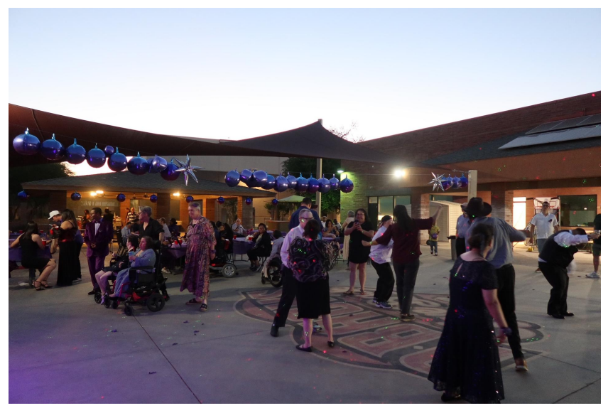
Prom night had us feeling euphoric! Dancing under the stars with your best friends? Count us in.