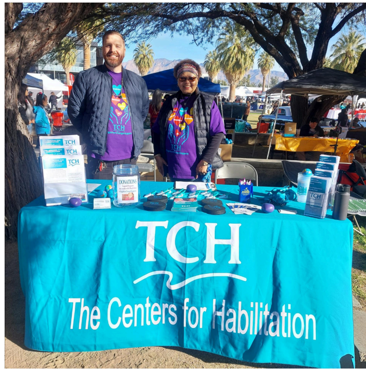
In town for the Arizona Bowl in Tuscon this past weekend? You might've seen some familiar faces!