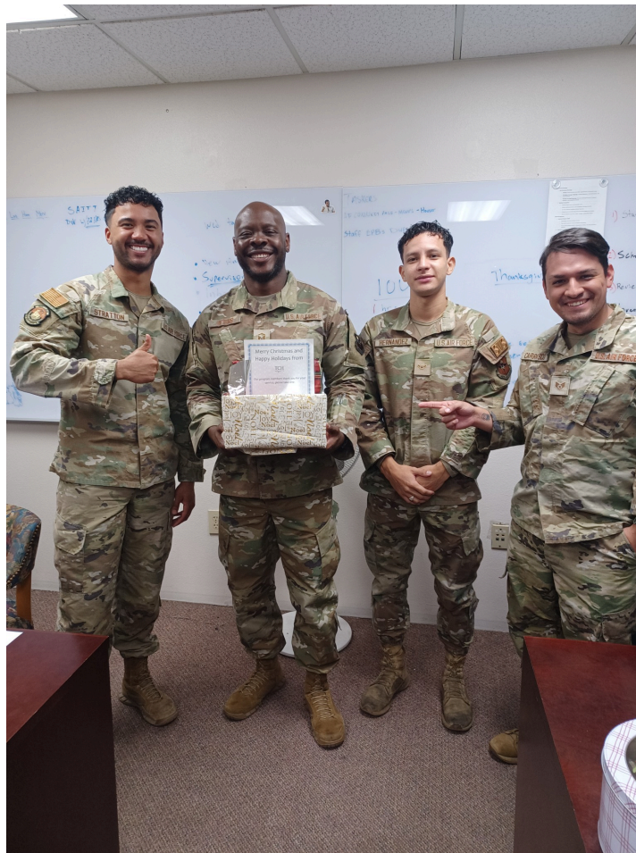
Our DTA program wrote Christmas cards to the soldiers out at Luke Airforce Base. Thank you so much for your service!