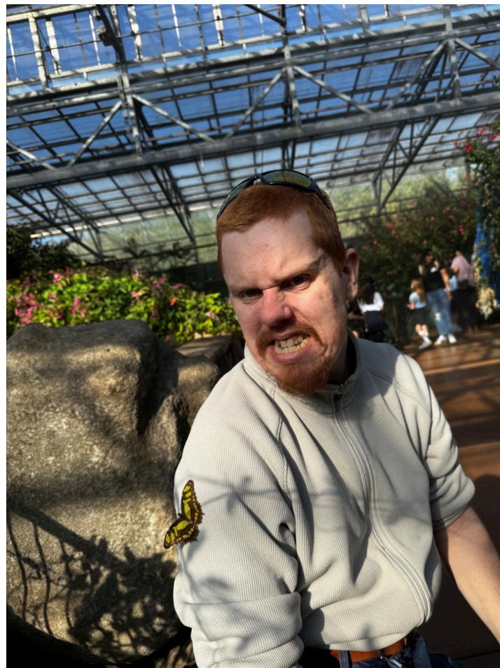
This month, we took a little trip over to Butterfly Wonderland in Scottsdale. A fan favorite around here!