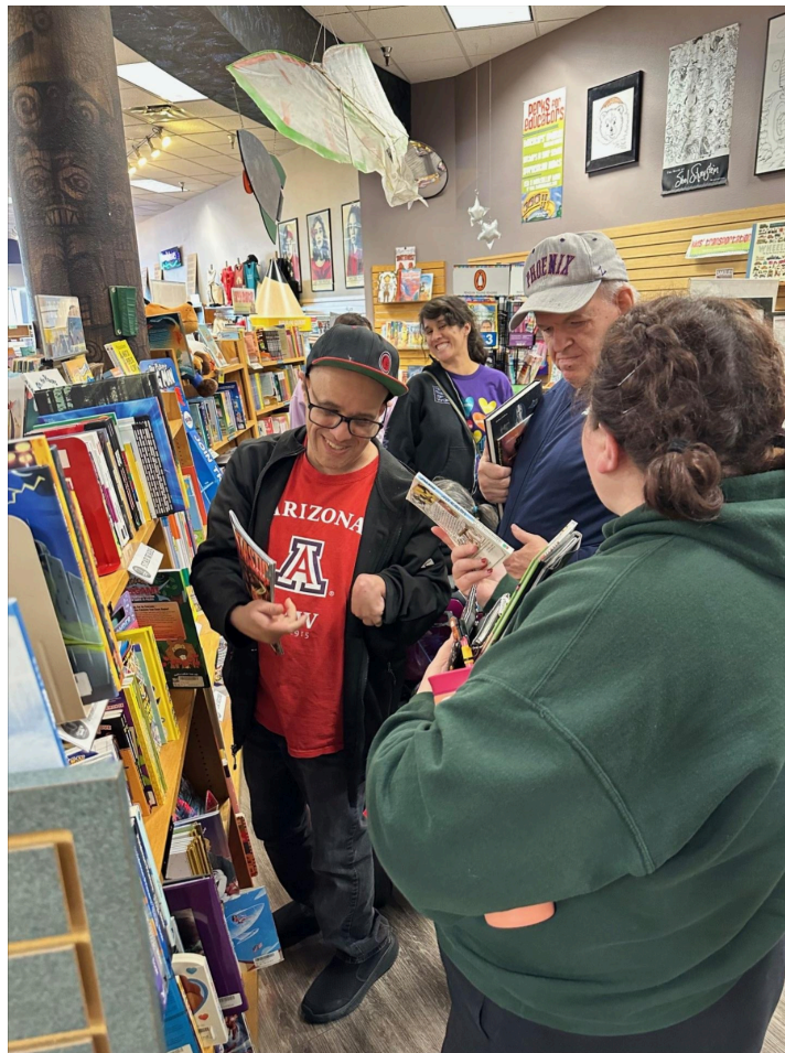
Who doesn't love a good book? A few members from our Story Club spent some time at Changing Hands Bookstore this month in search of some good reads.