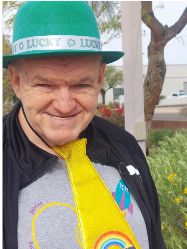
From our annual March - March around the block! Happy St. Patrick's Day from all of us at TCH. We are so lucky to have such amazing clients, staff, and donors like you!