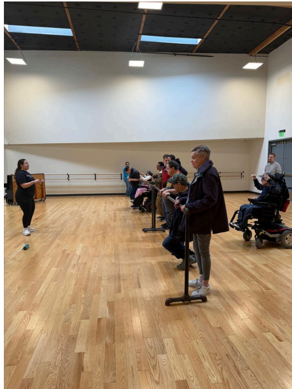
A day at the ballet! Thank you to our friends over at Ballet Arizona for hosting their fourth annual Sensory-Friendly performance hour. We had a great time in our class demonstration, touring the facility, and even getting a sneak peek of one of the company's upcoming performances.