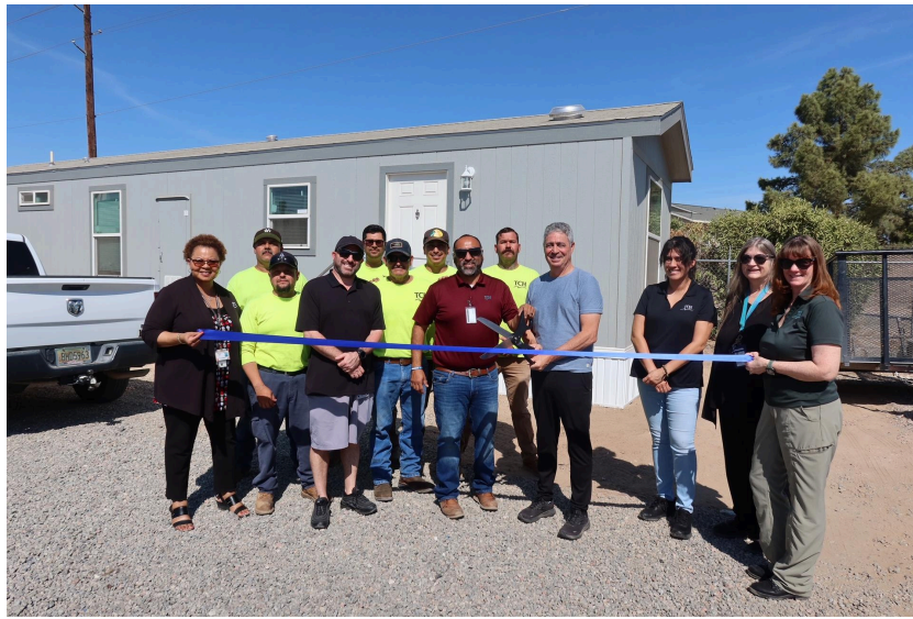
At the beginning of the month, a few of our administrative staff took a trip down to Yuma to visit one of our AbilityOne contract sites at Yuma Marine Corps Air Station. After 25+ years, the site received a brand-new work trailer, and we couldn't wait to celebrate with a ribbon cutting!