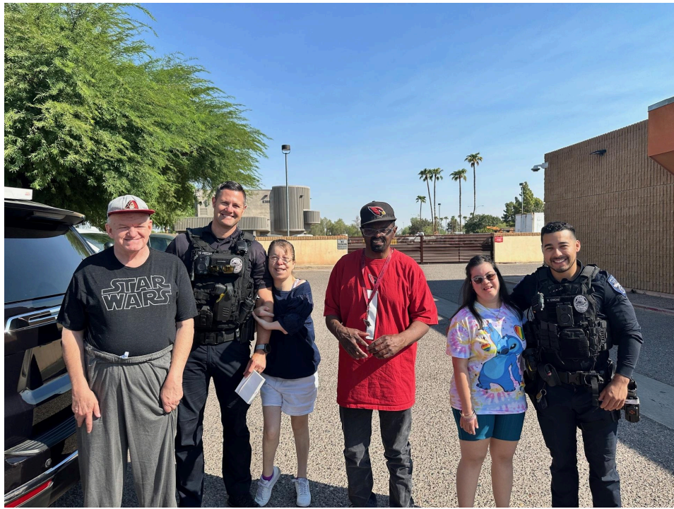
In honor of September 11th, we dropped off donuts and thank you cards for our local police and fire departments. Thank you to all the first responders for everything you do to keep our community safe!